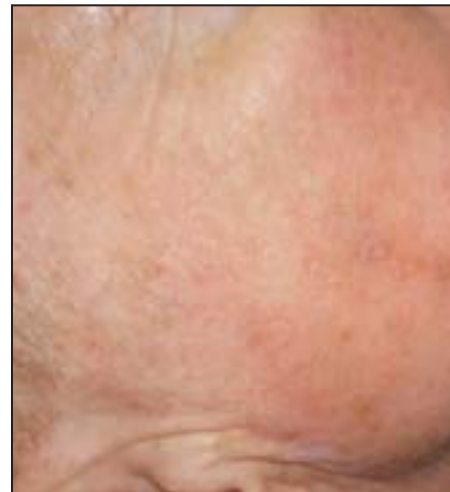
Three weeks after therapy, the treated area is back to normal coloration.

The 5-year survival rate correlated with