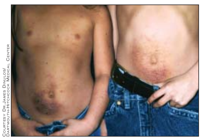
The nickel allergy with autoeczematization in these siblings was probably caused by belt buckles or clothing snaps.

ry, buckles, pant snaps, tools, and other products, noted Dr. Zug of the of the department of dermatology at Dartmouth Hitchcock Medical Center, Lebanon, N.H.