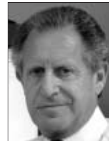
IMAGE OF THE MONTH

The NAMS statement is available at www.menopause.org/aboutmeno/consensus.htm . ■