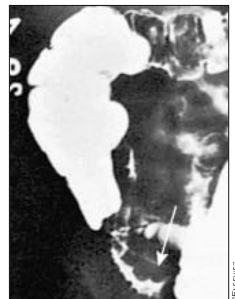
Barium enema postevacuation film shows marginal filling defects in the distal ileum in Henoch-Schönlein.