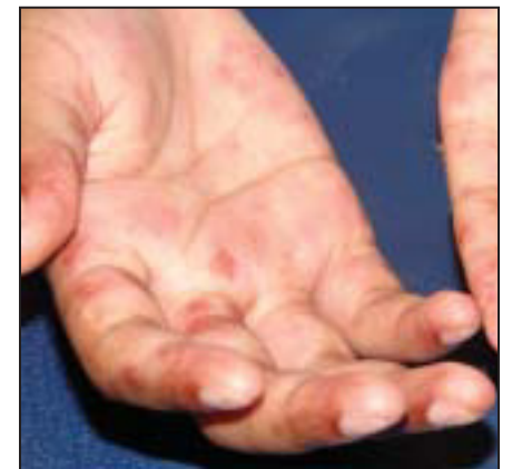
Vasculitic rash on the hands may be overlooked in a child with lupus.