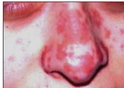
The classic malar rash crosses the nose of the young affected patient.