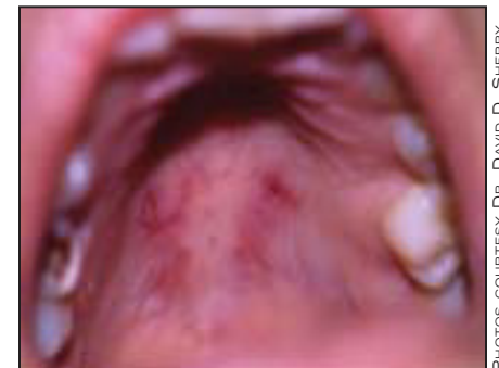
Painless oral ulcer of the hard palate may be the only outward sign of lupus.

In fact, he cautioned, 12%-20% of normal children have a positive ANA titer.