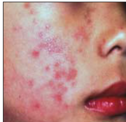
Spotty malar rash may mimic rosacea instead of having the butterfly shape.