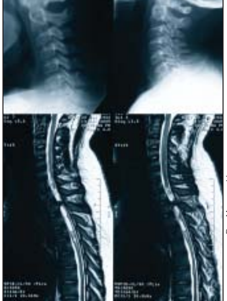
A normal spine x-ray (top) after a car accident: Serious damage became apparent only with an MRI (bottom).

Although this patient has not experienced significant improvement in his neurologic status, children do have remarkable recovery ability, and families should