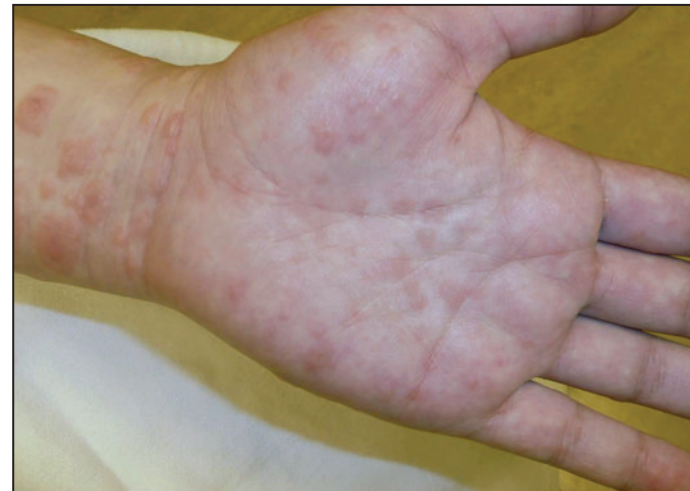
Erythematous edematous papules and vesicles are evident on the palm in this case of pemphigoid gestationis.

autoimmune blistering disease unique to pregnancy. It occurs in 1 in 50,000 pregnancies and is probably the least common dermatosis of pregnancy. The onset is usually in the second or third trimester, but in about 14% of cases, the onset can occur post partum. With pemphigoid gestationis, there is no change in maternal outcome, but there are risks to the fetus including being small for gestational age, preterm delivery, and neonatal pemphigoid disease.