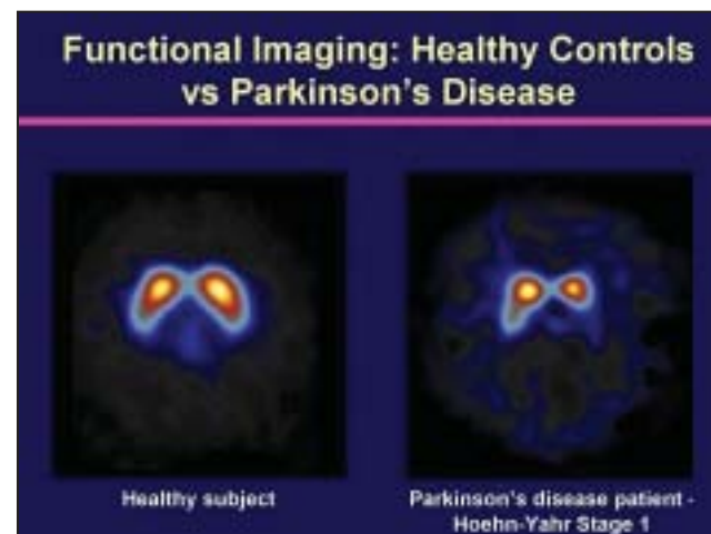
Imaging can detect asymptomatic neurologic changes. A SPECT scan of a patient with early PD shows reduced dopamine transporter binding on the as-yet unaffected side.

Constipation is another common finding during premotor PD, as shown by the lon-