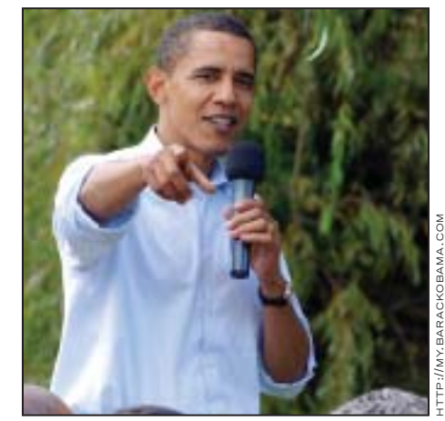
Sen. Barack Obama says his plan would save the average family $2,500 a year.

Cost control also is addressed in the Obama plan, with electronic health records playing a big role. The candidate proposes to spend $10 billion a year for the next 5 years in an effort to encourage adoption of EHRs. The plan also seeks to control costs through greater regulation of insurance companies and by allowing the fed-