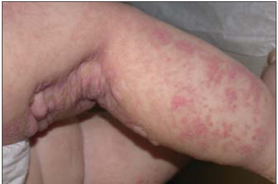
Symmetric linear red macules and soft spongy plaques are among the features characteristic of Goltz syndrome, which is known to be X-linked dominant.

Neurofibromatosis type 1-like (NF-1-like) syndrome shares the neurofibromatosis type-1 characteristics of multiple café-au-lait spots, axillary freckling, and macro-