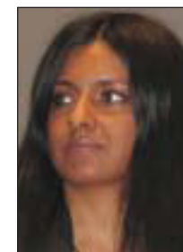
‘Previous studies of cardiovascular mortality have not controlled for traditional CV risk factors, as our work has done.’

After researchers controlled for traditional cardiovascular risk factors, psoriasis patients had a clinically significant increased risk of cardiovascular death (hazard ratio [HR] 1.55). This risk was modified by age, with patients aged 40 and younger being at greater risk (HR 2.65) than patients aged 41-60 (HR 1.90). This translated to an excess of 5.78 cardiovascular deaths per 10,000 person-years at age 40 and 58.9 per 10,000 person-years at age 60, she said.