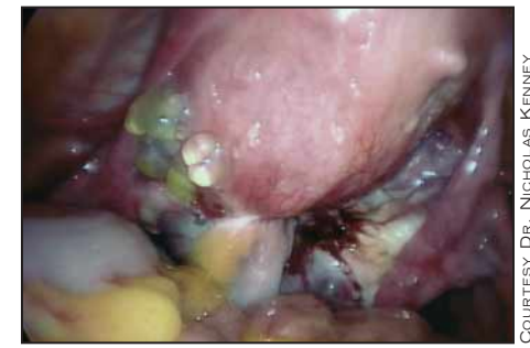
The rectum sticks to the posterior uterine surface in this endometriosis patient.

In his series, one patient developed a uterovaginal fistula, and another patient developed a rectovaginal fistula, both of which were successfully repaired.