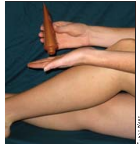
"Tan-in-a-can" products appear to be more popular with younger women.

STPs appear to be more popular with younger women. Fifty-four percent of 18- to 25-year-olds reported using them within the past year, compared with 41%