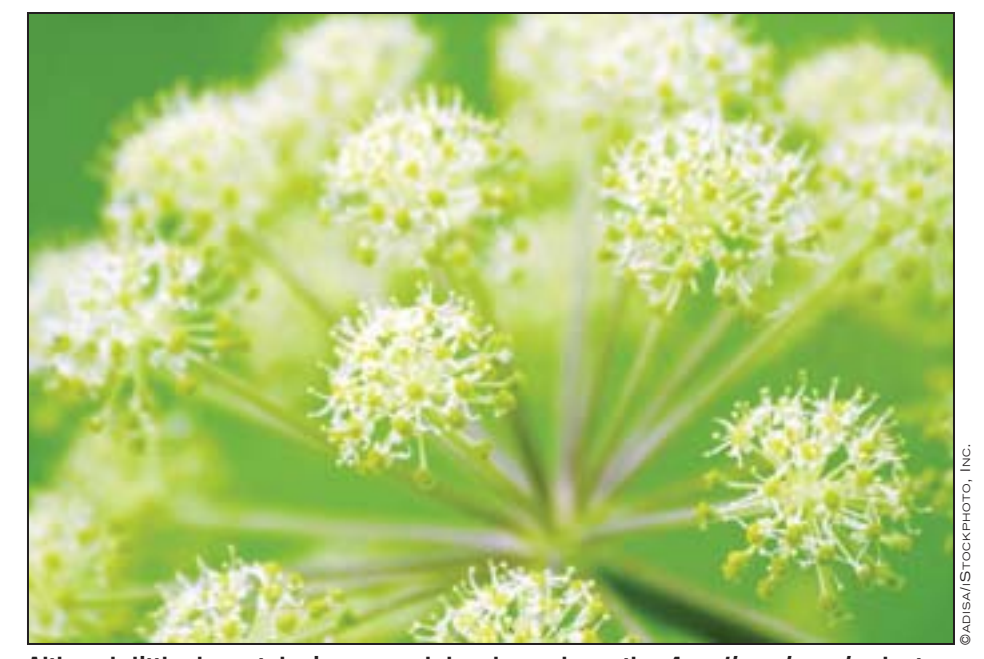
Although little dermatologic research has been done, the Angelica sinensis plant, also known as dong quai, appears to have antioxidant and antitumorigenic activity.

Specifically, angelica extract dose-dependently inhibited various neutrophil-dependent gastrointestinal lesions induced in rats by orally administered ethanol or indomethacin. The investigators concluded that angelica exhibits anti-inflammatory action, and might be effective in preventing neutrophil-dependent gas-