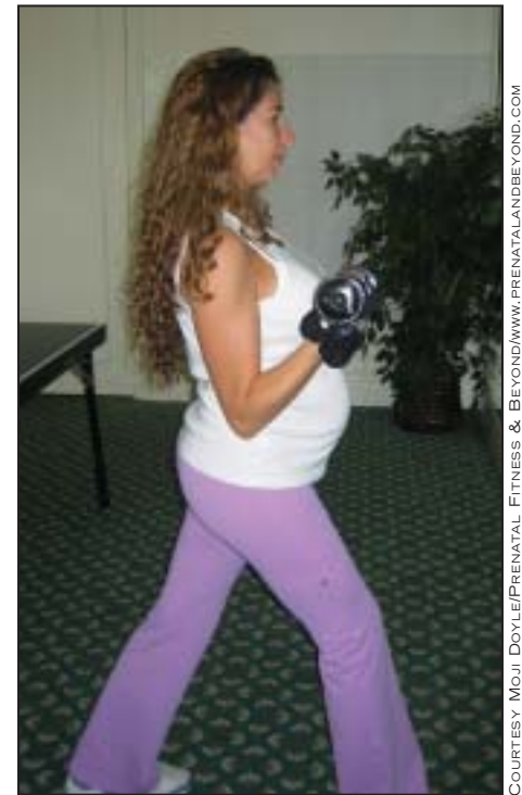
Most pregnant women without medical or obstetric complications can aim to engage in 30 minutes or more of moderate exercise a day.