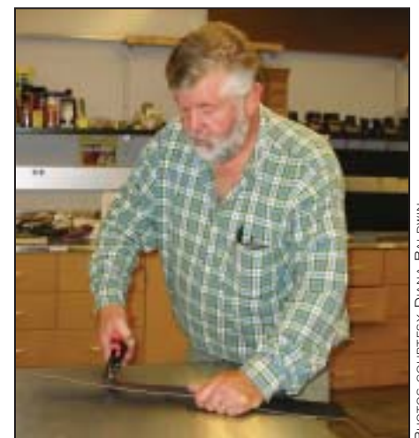
Before modification, leaning forward created greater tension on back muscles.

"We've found that it isn't enough to tell people, 'Cut back on your hours,' or 'Be more flexible,' or 'Don't do things that hurt,'" she said. "For the average working person with arthritis, that is not useful."