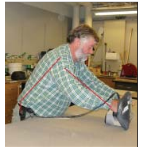
Unmodified task required static overreaching and bending of the trunk.