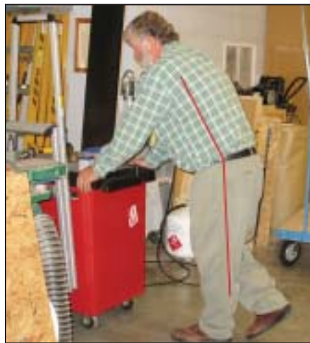
Before modification, the low cart height required the worker to bend forward.

Preventing or minimizing work-related limitations through timely therapy, rehabilitation, and workplace accommodation impacts not only the economy as a whole, but the patients' independence, self-esteem, and financial well-being, she stressed.