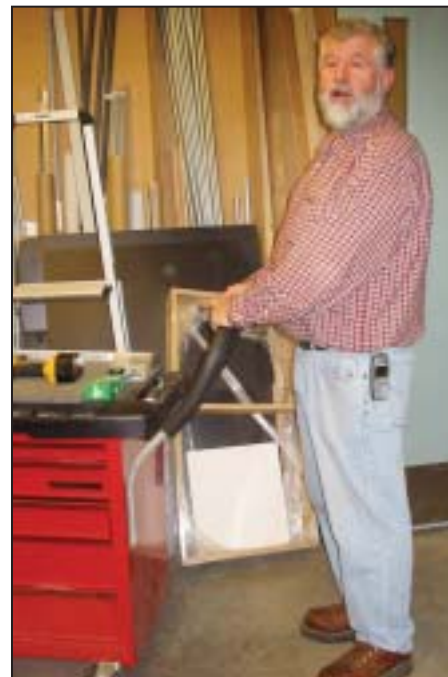
The modification of a raised handle decreased painful bending posture.