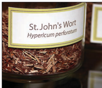
St. John's Wort may boost clopidogrel efficacy as well as treat depression.

“Depression plays a big role in coronary artery disease, and addressing depression is a big part of our cardiac rehab program. The next step in our research is going to be St. John's wort versus placebo to see if we get a double whammy: a treatment that improves platelet inhibition in patients on clopidogrel while also improving the