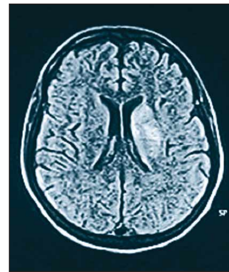
This MRI shows the brain of a pregnant woman who had an ischemic stroke.

pertensive therapy confirms the diagnosis. Volume contraction may be present, evidenced by a sharp drop in diastolic blood pressure and a rise in heart rate on standing from the supine position. Normal saline infusion for 24-48 hours may be considered to achieve volume expansion, decrease the