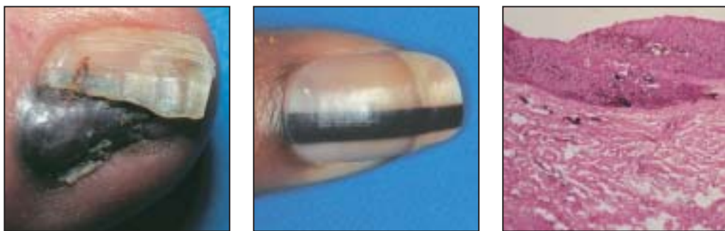
From left to right: malignant melanoma that arose from longitudinal melanonychia; longitudinal melanonychia that proved to be melanoma in situ; biopsy from melanoma in situ.

Because the nail matrix is the source of pigmentation (about 90% of melanocytic bands arise from the distal matrix and 10% from the proximal matrix) biopsies must be taken from the nail matrix and not the nail bed. A recent article has described the use of dermoscopy of the free edge of the nail to determine the level of nail plate pig-