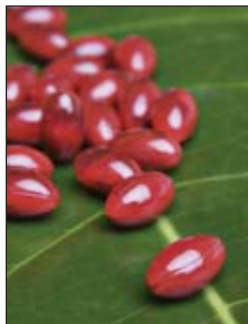
β-Carotene had no benefit for those taking it less than 3 years.