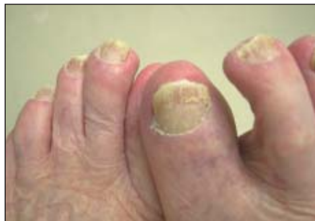
Bad prognostic factors for onychomycosis include dermatophytoma, thick nail, and a total dystrophic nail.