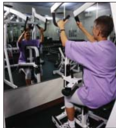
Resistance training can be incorporated into heart failure rehab programs.

A notable conclusion of the new statement is its discussion of RT for persons with heart failure. Despite concerns that RT in such persons may exacerbate their condition because of potential adverse left ventricular