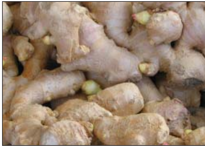
“There is quite a bit of evidence in clinical trials” to support the safety of ginger in pregnancy, says Dr. Cathi Dennehy.

► Vitamin B 6 . Two randomized, controlled trials (with 59 and 342 patients, respectively) found that vitamin B 6 supplements worked significantly better than placebo to decrease severe nausea and vomiting in pregnancy or to decrease over-