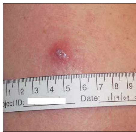
Patients who have been previously vaccinated evince a lesser reaction.