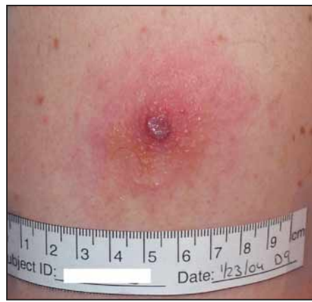
Vaccine-naive patients typically show a robust vaccination site reaction.