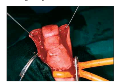
Granulation tissue is removed by using large and deep excisions.

Surgical excision of hyperkeratotic tumors or lateral horns may be necessary to resolve traumatic toenail issues, but the first and most important treatment approach is conservative, consisting of selection of proper footwear and use of silicon prosthetic devices that can accommodate anatomic foot variations within patients' shoes.