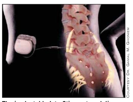
The implantable InterStim system delivers mild electrical pulses to the sacral nerves.

Suitable patients benefit greatly from this therapy, said Dr. Ghoniem. "This disorder can make people very upset and anxious. They have had urinary incontinence for years. They've tried different medications, different doctors, and nothing works—they still go to the bathroom all day and all night and they are miserable. But once this changes for them, they are