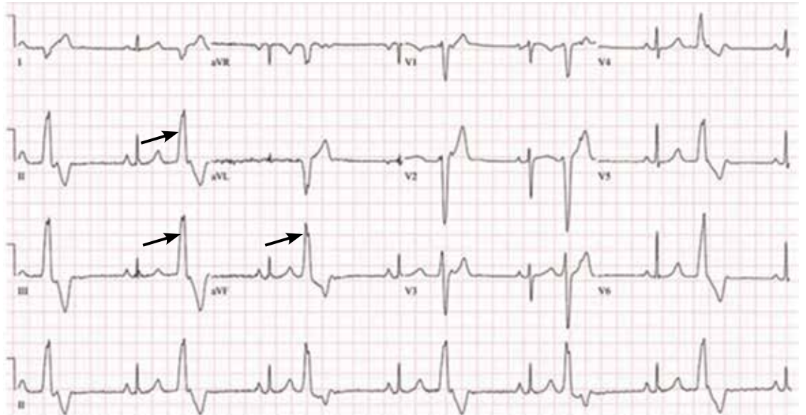
FIGURE 2. Typical configuration of right outflow tract premature ventricular complexes (PVCs) in the 12-lead electrocardiogram. The PVCs exhibit a tall R wave in the inferior leads (arrows) and a left bundle-branch block pattern.

arise from both the tricuspid and mitral valve annuli, the left ventricular fascicles, or from the epicardium.