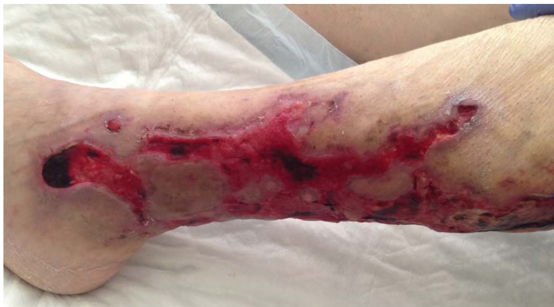
FIGURE 1. The patient's left lower leg had a star-shaped ulceration that included large areas of granulation tissue and necrotic tissue.

A 64-YEAR-OLD MAN WAS admitted for extensive painful ulceration of the left lower leg ( Figure 1 ) that occurred after a fall and that had worsened over the last 4 months.