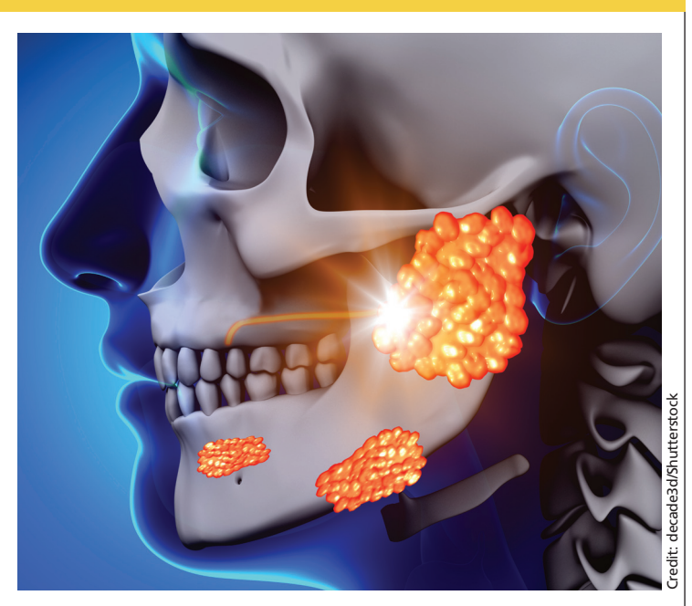
FIGURE 1 The Major Salivary Glands

The three pairs of major salivary glands are the parotid (at right), the submandibular (center), and the sublingual (left). The characteristic swelling of mumps most often involves the parotids but occasionally, the other glands are affected as well.