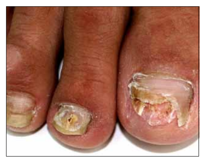
Figure 1. Onycholysis and onychodystrophy affecting the toes.

20% to 40% of all onychopathies and approximately 30% of cutaneous mycotic infections.<sup>1,2</sup> There are many methods available to confirm the clinical diagnosis of onychomycosis by detecting the causative organisms. Direct microscopic examination of the scraping with a KOH culture, histopathologic assessment with periodic acid–Schiff staining, immunofluorescence analysis with calcofluor white staining, enzyme analysis, and polymerase chain reaction can be used for diagnosis of fungal infections. The most frequently used diagnostic method for onychomycosis