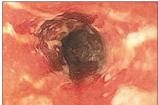
Figure 1. An upper endoscopy showed eroded esophageal mucosa with a white exudate.

Although PV may have been considered a fatal disease at one time, treatment with systemic steroids has made it a manageable, albeit relapsing, condition. The development of corticosteroid-sparing, adjuvant immunosuppressives such as MMF has allowed for the more aggressive treatment of this disease with fewer steroid-related side effects. 4,8,9 As