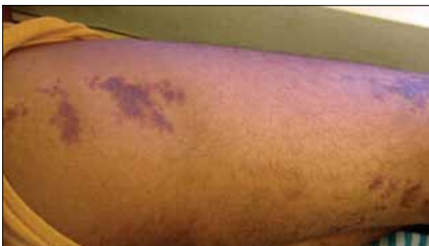
Figure 1. Lesions on the right leg extending to the buttock.

Verrucous hemangiomas are best treated by excision. Larger lesions will need grafting. There is a tendency for recurrence to occur unless excision is complete. 1 Yang and Ohara 7 reported 14 patients with small localized lesions that were cured by 1 session of surgery without recurrence; 9 patients with wider and more extensive lesions required combination therapy in several stages for optimal results.