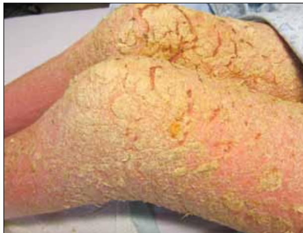
Figure 1. Generalized crusts and hyperkeratotic plaques on both legs.

Cases of HTLV-1 and crusted scabies have been reported in Brazil, Peru, and Central Australia. 3,4,7 A retrospective study in Brazil showed a notable association between HTLV-1 infection and crusted scabies; of 23 patients with crusted scabies, 21 were HTLV-1 positive. 3 In another small study from Peru, 23 patients with crusted scabies were tested for HTLV-1 and 16 (70%) were seropositive. 4 Neither study had a control group for comparison; however, interestingly, the estimated seroprevalence in the general population (based on blood donors) is only 0.04% to 1% and 1.2% to 1.7% in Brazil and Peru, respectively, thus reinforcing the association between HTLV-1 and crusted scabies. 1 Crusted scabies and HTLV-1 seropositivity acting as a predictor for adult T-cell leukemia/lymphoma (ATL) has been reported 8 but not consistently. 3 Our patient had abnormal serum protein electrophoresis findings. Although the results were not diagnostic of ATL, patients with HTLV-1 are at increased risk for ATL and the presence of this virus is important to document when