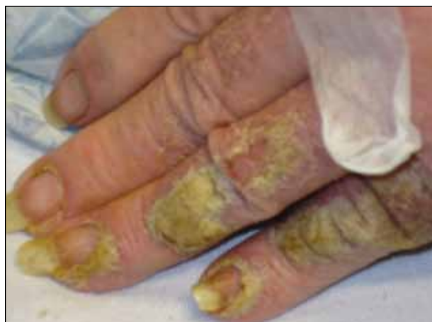
Figure 2. Crusts on the dorsal aspect and interdigital web space of the left hand.