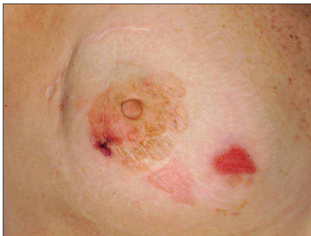
Figure 1. Radiation-induced pemphigus vulgaris with superficial erosion on irradiated right breast.

Subsequently, she developed oral and ocular erosions that were compatible with pemphigus and were believed to be precipitated by trauma secondary to dental work and to the use of contact lenses. These flares were treated and stabilized with short courses of prednisone at higher doses that were successfully tapered to a maintenance dose of 5 mg every other day to control the pemphigus. With that prednisone dosage, her disease has remained clinically stable.