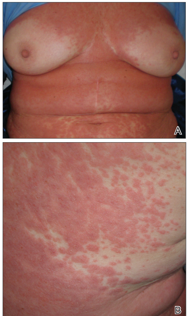
Figure 1. Physical examination revealed a confluent maculopapular rash extending over the trunk (A and B).

The patient was given intravenous methylprednisolone 120 mg once daily for 1 week in gradually decreasing doses. Three weeks of steroid therapy were necessary to obtain the first good results. Improvement of the patient's clinical condition was considerably slow. Fever and rash gradually disappeared and the patient was discharged with oral corticosteroids. In the 2 months after starting systemic corticosteroid therapy, the lesions had not progressed and all other clinical symptoms improved.