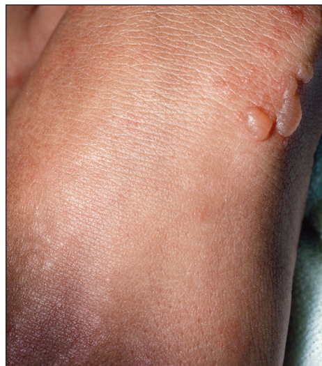
FIGURE 6. Bullous systemic lupus erythematosus demonstrates active vesicles and bullae on a sun-exposed area of the wrist.