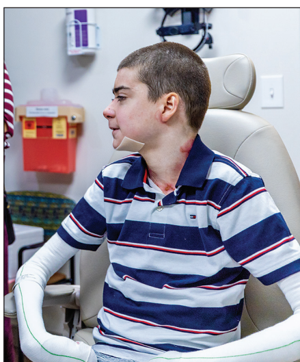
FIGURE 3. Recessive dystrophic epidermolysis bullosa complicated by cicatrizing conjunctivitis in a teen who underwent successful surgery and ophthalmic gene therapy to restore his sight.

The 2 major clinical manifestations of EBA include a mechanobullous disease resembling inherited forms of DEB (Figure 4) and an inflammatory bullous pemphigoid (BP)-like disease, 23 as well as a combination of both types of skin lesions (Figure 5). The skin and mucous membranes of the oral cavity, esophagus, eyes, and urogenital areas are affected in both types; scarring may cause functional disabilities. In the mechanobullous type of EBA, it is common for blisters and erosions to develop in trauma-prone areas such as the hands, feet, elbows, and knees. The blisters tend to heal with scarring and milia formation as might be seen in porphyria cutanea tarda or cicatricial pemphigoid, which are in the differential diagnosis. Dystrophy of the fingernails or complete nail loss may be observed,