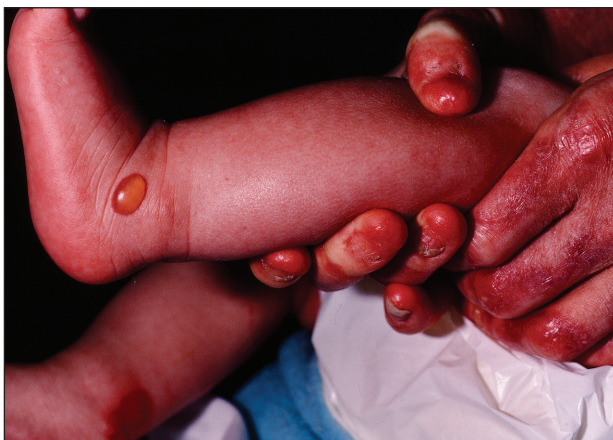
FIGURE 1. Bulla on the ankle of an infant and scarring on the hands and severe nail dystrophy with nail loss in a parent with autosomal-dominant dystrophic epidermolysis bullosa.

Clinical management of all EB variants, especially the severe recessive types, traditionally has been limited to the prevention of trauma to the skin and mucous membranes and supportive care, including dressing changes to erosions and ulcerations, antibiotic ointments as needed, and amelioration of pain and pruritus. Bone marrow and pluripotent stem cell transplants have been attempted. 12 Complications of EB, such as deformities of the hands and feet caused by excessive scarring, esophageal strictures, poor dentition, and squamous cell carcinomas, must be addressed by a multidisciplinary team of specialists, including plastic surgery, gastroenterology,