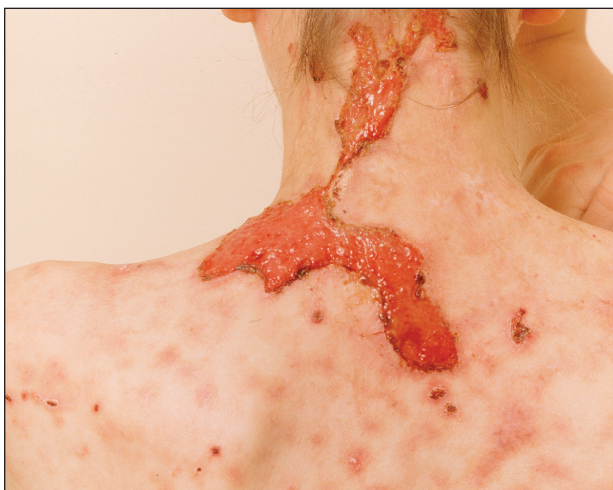
FIGURE 5. Epidermolysis bullosa acquisita with severe ulcerations on the neck and back secondary to blisters with scarring.

Histopathology shows subepidermal separation with collections of neutrophils and nuclear fragments in the blister cavity. The differential diagnosis of BSLE includes EBA, BP, dermatitis herpetiformis, and linear IgA bullous dermatosis. Direct immunofluorescence testing shows