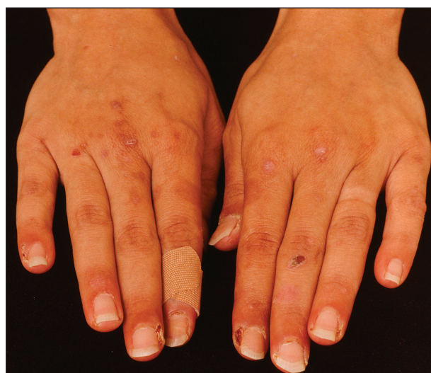
FIGURE 4. Epidermolysis bullosa acquisita (mechanobullous type) of the hands shows small blisters, scarring, and erosions of the lateral nail folds.