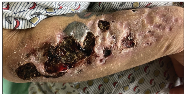
FIGURE 1. Ulcerated necrotic plaque with hemorrhagic crust and focal areas of scarring on the right posterior forearm.

A punch biopsy from the right forearm demonstrated an ulcer with a mixed infiltrate, dermal necrosis, and clusters of Gram-positive cocci, indicating a bacterial infection. There was no evidence of leukocytoclastic vasculitis (Figures 2 and 3). Electromyography confirmed