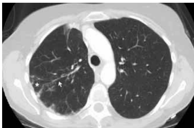
FIGURE 1. Computed tomography done in April 2010 revealed an area of scattered linear, nodular, and “tree-in-bud” opacities (asterisk) in the right lung. Note the pleural-based linear opacities and bronchiectasis (arrow).

On examination, the patient was lean, with a body mass index of 20.53 kg/m 2 . She appeared calm, well-groomed, and well-dressed, and had a very polite manner. When she coughed, she tried to suppress it, as if she were self-conscious about it. Her heart rhythm was irregularly irregular with a normal rate.