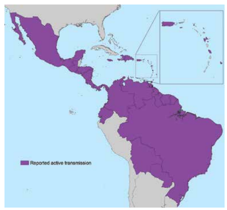
FIGURE 1. Reported transmission of Zika virus in the Americas.