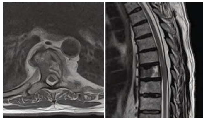
FIGURE 1 Magnetic-resonance imaging of the spine with contrast. Left, axial T1 weighted; Right, sagittal T2 weighted.

Given the diagnosis of APL, the patient was urgently admitted to the hospital to begin treatment with ATRA and chemotherapy. Induction was started with idarubicin 12 mg/m 2 (days 2, 4, 6, 8) and ATRA (AIDA regimen). 10 His course was complicated by differentiation syndrome responsive to steroids, E. coli sepsis, C. difficile colitis, and presumed fungal pneumonia. He did not experience any coagulopathic complications. A repeat bone marrow biopsy after induction demonstrated a normocellular marrow with no morphologic evidence of residual APL. A positron-emission tomography-computed-tomography scan performed to evaluate his T7 lesion was negative. Given his normal white blood cell and platelet counts at presentation, the patient was stratified as low risk, despite his extramedul-