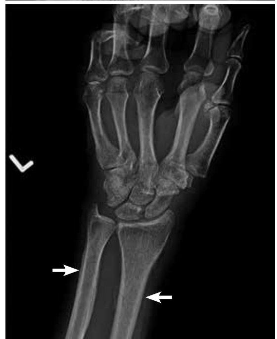
FIGURE 2. Radiography of the hands and feet showed thickening of the periosteal membrane and formation of new periosteal bone (arrows).