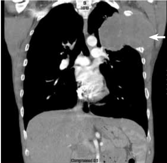
FIGURE 1. Computed tomography showed a mass in the left upper lobe of the lung (arrow), eroding the ribs and extending into the axilla.

His joint pain had worsened over the past 2 months