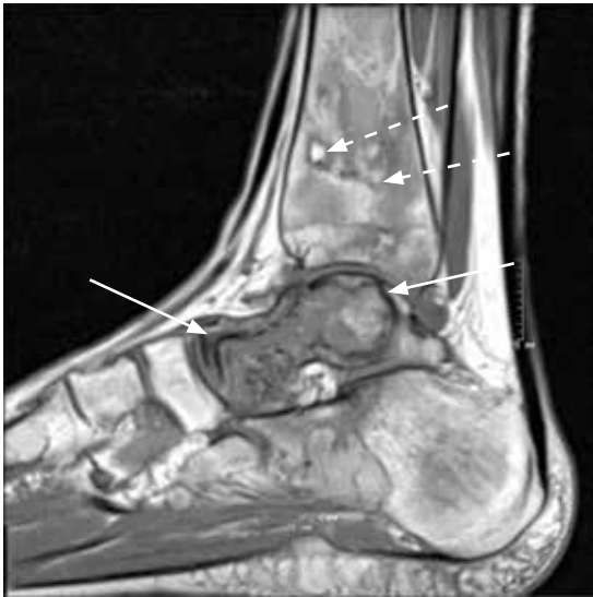
FIGURE 3. On sagittal T1-weighted magnetic resonance imaging, the serpentine black line indicates avascular necrosis in the talar head, neck, and body (solid arrows). Found incidentally were smaller foci of avascular necrosis in the distal tibial metaphysis and epiphysis (dashed arrows).