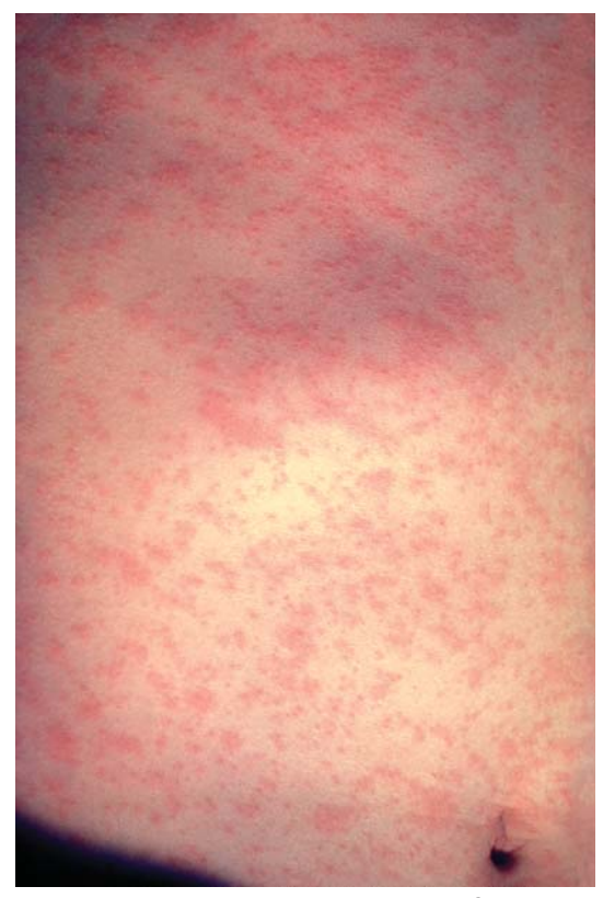
FIGURE 2. Measles on the 3rd day of rash.