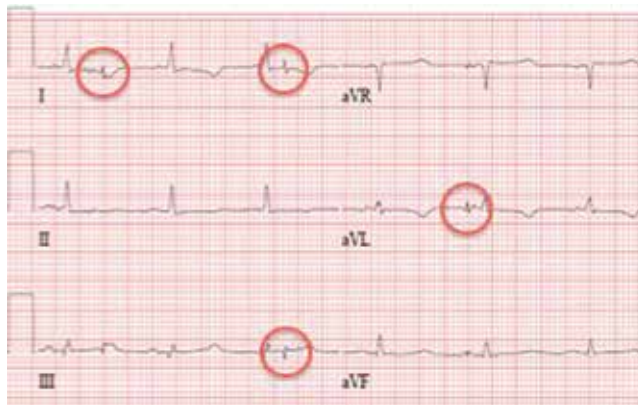
FIGURE 2. Electrocardiography 6 weeks after the device was placed showed normal sinus rhythm, but with inappropriate device discharges (circles).

Electrocardiography at the time of presentation showed a normal sinus rhythm with inappropriate ICD discharges (FIGURE 2). This finding prompted chest radiography, which showed that the ICD had rotated 90 degrees from its original position, and that the lead had completely wrapped around the generator and thus was no longer correctly positioned (FIGURE 3). The patient admitted to frequently rubbing (ie, twiddling) the area, which led to twisting and dislocation of the device, a complication known as twiddler syndrome.