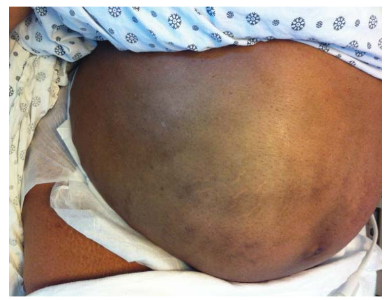
FIGURE 1. Ecchymosis of the abdominal wall, predominantly of the right flank (Grey Turner sign).