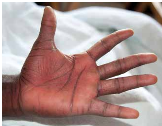
FIGURE 2. The patient had confluent erythema with petechiae on the palms.

standard vaccines including a tetanus booster were up to date.