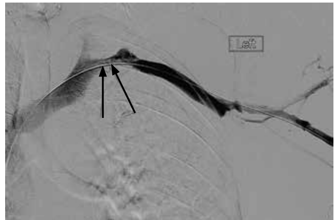
FIGURE 2. After 3 days of thrombolytic therapy, venography showed a 50% residual stenosis of the left subclavian vein.

A 43-YEAR-OLD MAN with no medical history presented with pain and swelling in his left arm for 2 weeks. He was a regular weight lifter, and his exercise routine included repetitive hyperextension and hyperabduction of his arms while lifting heavy weights.