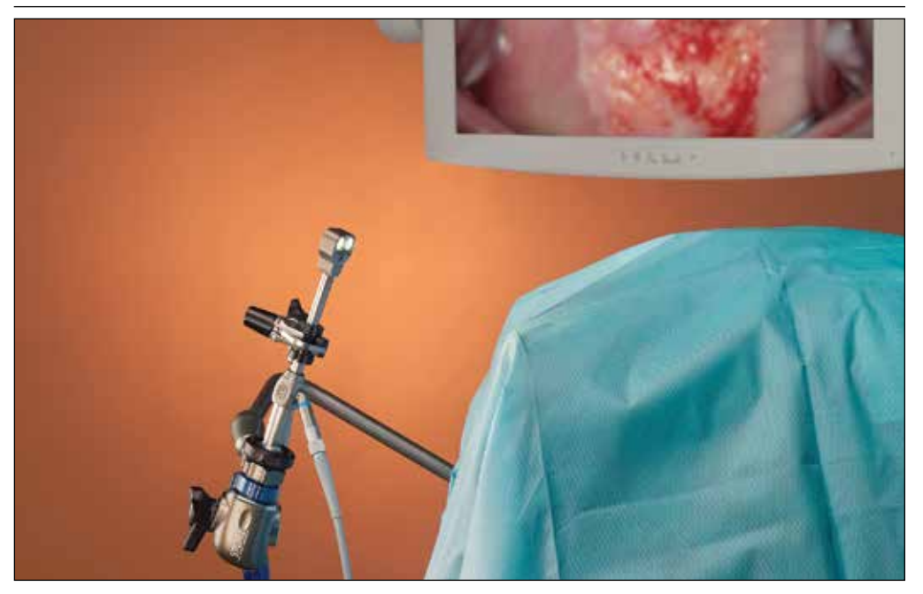
FIGURE 2 VITOM system

The VITOM system can be manipulated directly by the surgeon or assistant