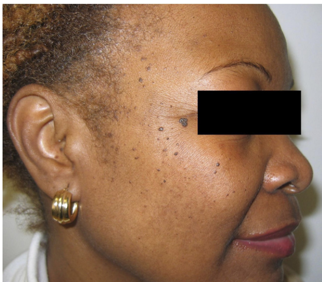
Figure 3 Dermatitis papulosa nigra in a 52-year-old African-American woman.

The lesions are characterized by multiple hyperpigmented (dark brown to black) smooth papules measuring 1-5 mm in size. They typically occur symmetrically on the face, favoring the malar eminences, and may also involve the neck, chest, and upper back (Fig. 3). Although the etiology is not known, a genetic predisposition is thought to be a key factor. A positive family history is often found. However, because DPN tend to be distributed in sun-exposed areas, some authors have suggested that sun may play a role in the etiology—a hypothesis that has also been reported for seborrheic keratoses in some populations. 52,53 Niang et al 54 further comment on this hypothesis in a Senegalese study. In addition to observance of a prominence of lesions present in sun-exposed