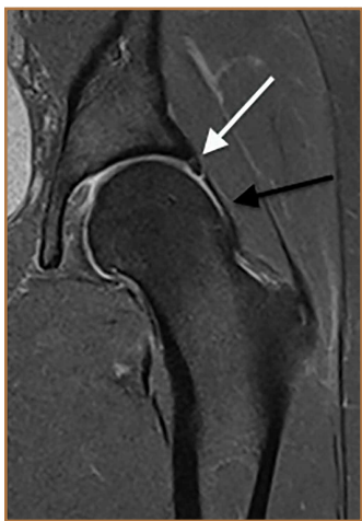
Figure 2. T2-weighted magnetic resonance imaging arthrogram of left hip in symptomatic 18-year-old woman shows characteristic loss of femoral head-neck offset (cam lesion, black arrow) and concomitant labral tearing (white arrow).