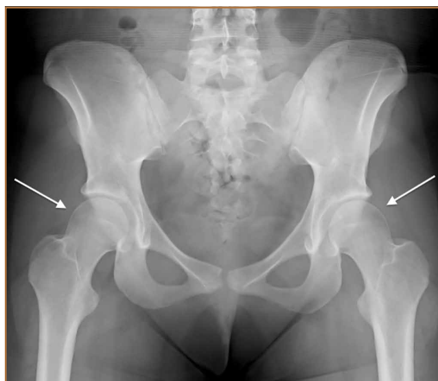
Figure 1. Anteroposterior radiograph of pelvis in 17-year-old girl with cam lesions of proximal femurs (white arrows).

Authors' Disclosure Statement: The authors report no actual or potential conflict of interest in relation to this article.